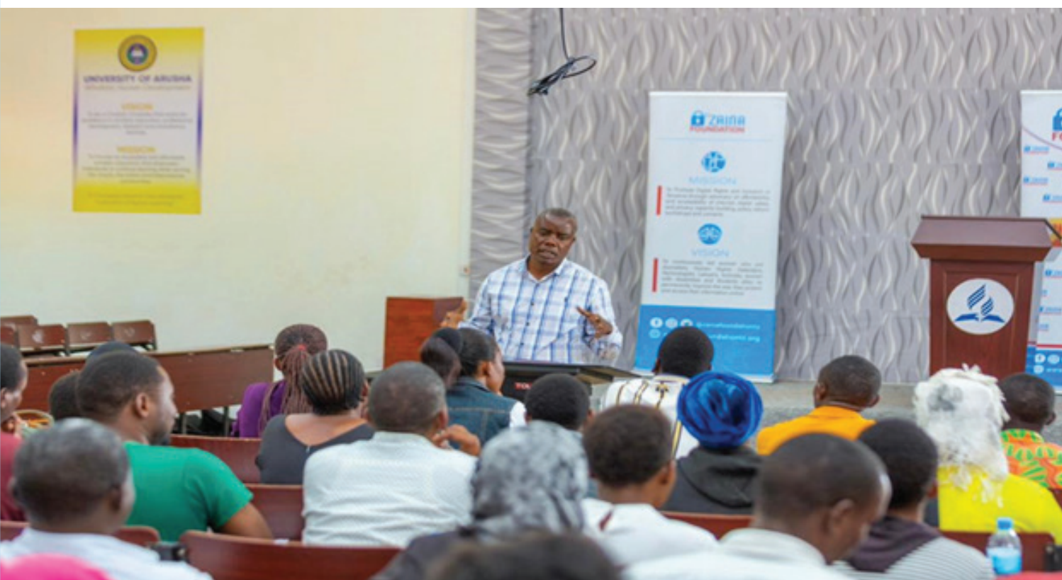
Facilitator during Digital Voice training

January 12-14, 2023 Zaina Foundation conducted Digital Voice training of young women activists at the University of Arusha with a total of fifty students who trained about digital rights and how civic space in Tanzania can be expanded by using technology among young women activists. ZF addressed the issue of Online Gender Based Violence and how it affected participation of young women in online platforms in Tanzania. Through this training ZF established the Digital Rights Club of University of Arusha which will be sustainable in advocating for digital rights and access to information using technology in a safe environment for young activists in Tanzania.