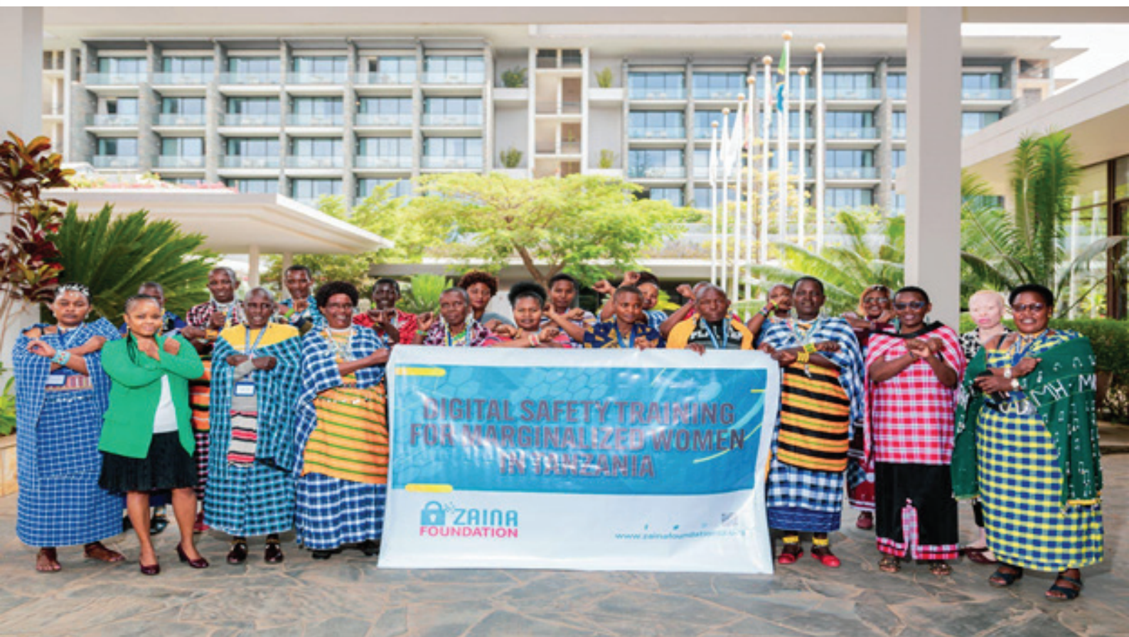
Participants group photo during Digital safety training

Maasai women are among at-risk communities in Tanzania facing gender inequalities and gender violence many NGO not reach this community during capacity building and other physical social support due to fear and limited resources. Recently maasai women experience surveillance and tracking in communication due to ongoing relocation led to struggles on land and cattles.