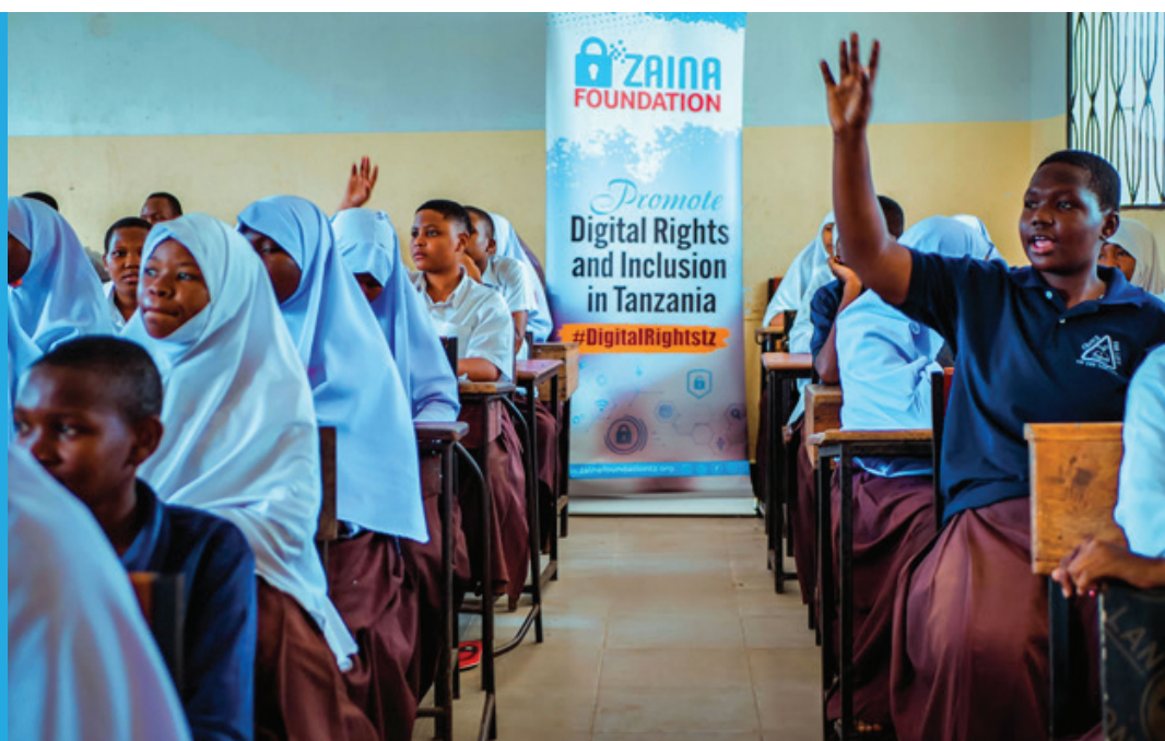
Students participating in Q & A session

Zaina Foundation continues implementations of Digital Rights Clubs program in Tanzania since January 2024. Until November the foundation reached 820 from 5 schools in Dar es salaam and Arusha regions. In these clubs’ students were empowered with knowledge and skills to address online gender-based violence (OGBV), Emerging Technologies including Artificial Intelligence and Robotics and online safety.