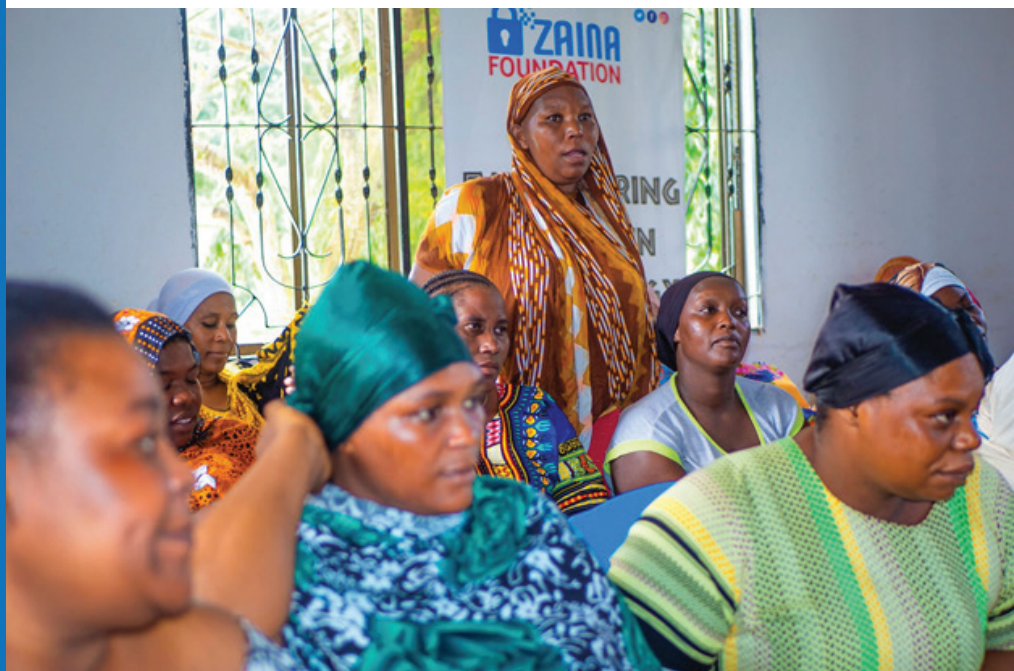
One of the participants responding to a question during the IWD commemoration event with women from Kiromo ward

Participants highlighted the importance of digital literacy in combating online gender-based violence (OGBV) and leveraging technology for business and social connectivity. As Zaina Foundation continues to bridge the digital divide and fostering inclusion, further sensitization on digital rights, inclusion and establishing community labs for connecting women in digital platforms stand to be among our key priorities.