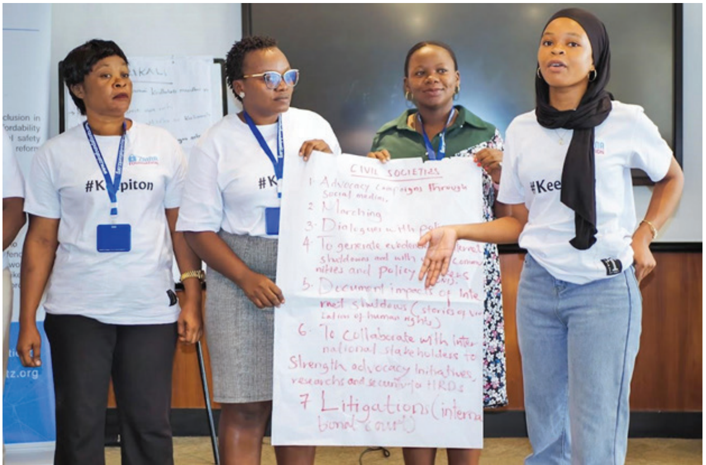
Internet shutdown fellows doing group presentation on the role of civil society organizations in responding to internet shutdown incidences

- Zaina Foundation implementing the Internet Shutdown project (Predict, Prepare, Prevent, Respond to Internet shutdown ahead of elections in Tanzania 2024/2025), Zaina Foundation has been hosting virtual monthly meetings with 20 fellows from 8 regions across Tanzania. These fellows are actively engaging in the internet freedom campaign through social media platforms. The meetings serve as the means for strengthening the capacity of fellows to enhance their internet freedom advocacy plans, performing network measurement using Open Observatory for Network Interference (OONI) tool and documenting the impact of internet shutdown.