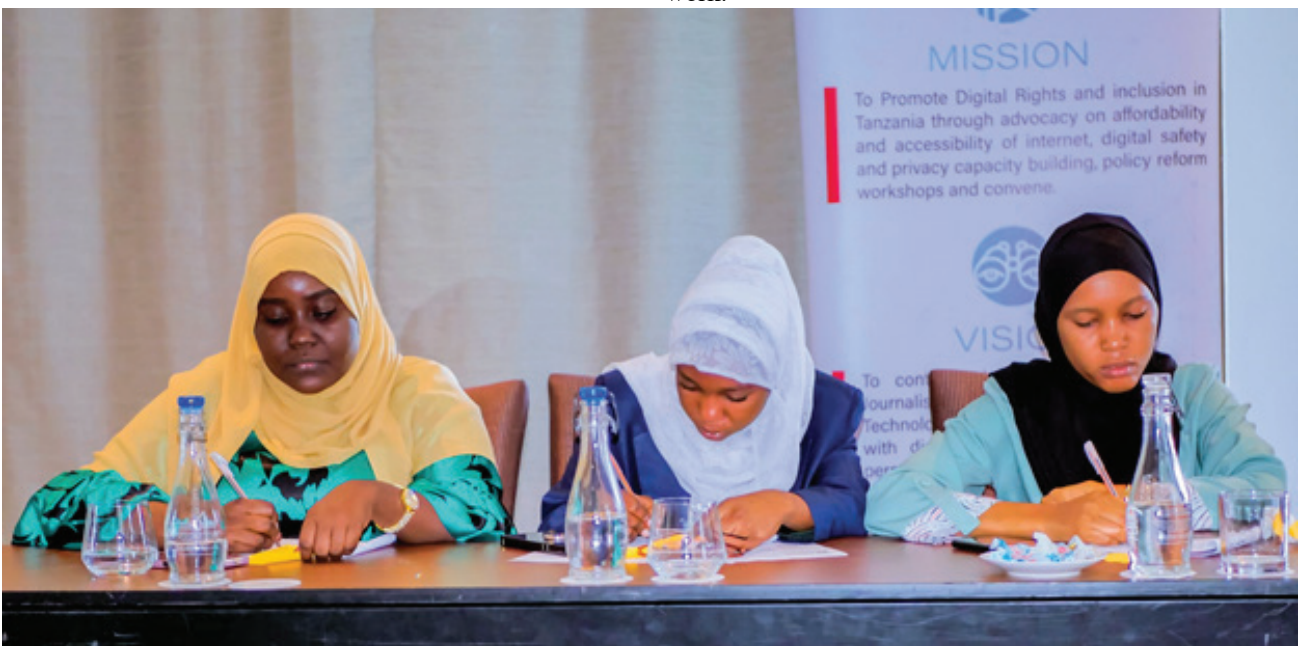
Cross-section of participants doing a table-top exercise for drafting an online safety plan

The training took place at Hotel Verde for two days from June, 2024. The primary goal was to raise awareness about specific digital security risks and vulnerabilities affecting women journalists. Moreover, the training delivered practical strategies and tools for ensuring safety online for women journalists, and fostering a supportive community for women journalists in Zanzibar to share their experiences and best practices in their work.